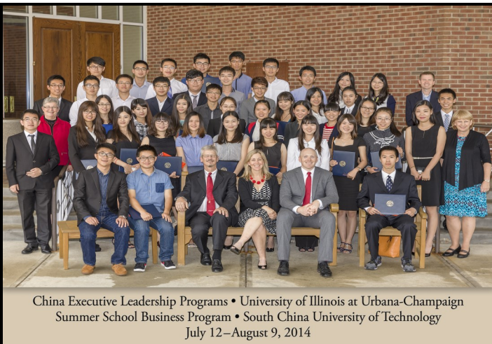
China Executive Leadership Programs • University of Illinois at Urbana-Champaign Summer School Business Program • South China University of Technology July 12–August 9, 2014

The University of Illinois is situated in the middle of a vibrant community, rich in culture, with plenty of activities suitable to your interests. Please use the following link to access more detailed information about our campus and community: www.illinois.edu